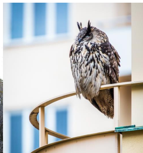
White-tailed eagle, giant oak and eagle owl in the Royal National City Park in Stockholm, Sweden

We call you to a conference focused on biodiversity in northern cities – assessing biodiversity and the potential to strengthen it and how to go about it.